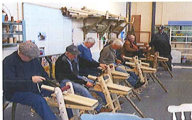
Wood turning the old-fashioned way on the pole lathe.

The Shed is open 4 days a week (closed Wednesdays) and is situated next to East Down Running Club, 3 Ballydugan Industrial Estate.